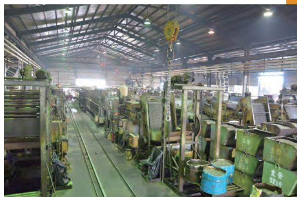
Heat treatment plant. All 4 production lines are launched