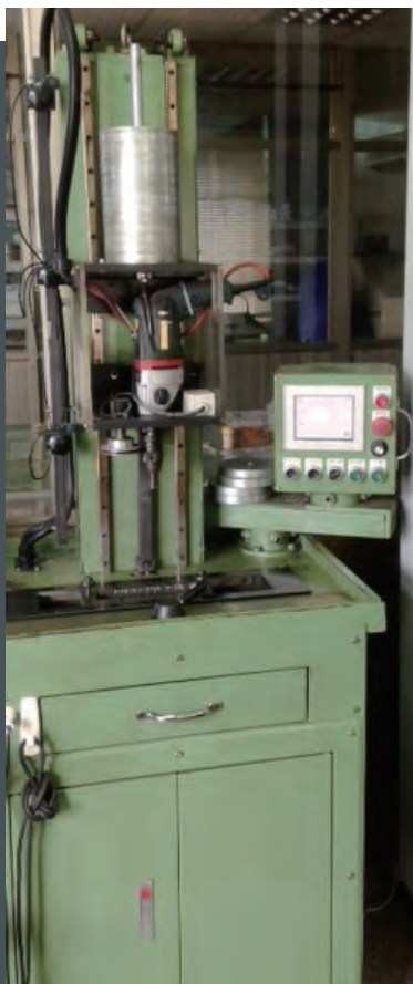
Tapping speed tester