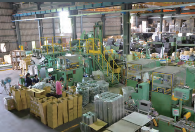
△ Chang Yi invested NTD 30 million in an automated packaging plant which has been completed and started operation.