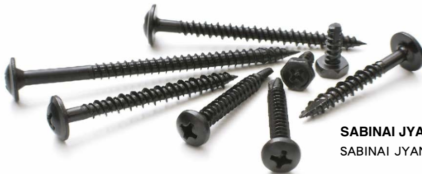
SABINAI JYAN Coating SABINAI JYAN 塗佈技術

To reduce chips, the self-tapping screws would have to be applied with adhesives, or the fastened object has to be attached with a device to capture chips. Doing so would increase costs. To tackle this, Yamashina analyzed the generation of chips as well as their constituents, and succeeded in developing a self-tapping screw with a brand-new shape that can be used on EVs, drones, robots and circuit boards.