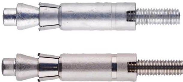
Smart Expansion Anchor 智慧化膨脹錨栓

TR's experience over the last few years is that many of these are designed in specials and required in high volume. There are a number of different types and as a guide the TR's Compression Limiter range consists of symmetrical, flanged, split seam and oval manufactured from steel, stainless, brass and aluminium.