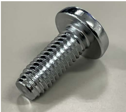
Clean Tap Self-tapping Screw Clean Tap 防碎屑自鑽螺絲

Japanese Tohnichi successfully developed CEM3-BTLA Series Wireless Torque Wrench utilizing HOGP Bluetooth data transmission. At the press of a button, the measured values will be input in a business form to efficiently and correctly record torque values and angles. Besides, it can detect duplicate fastenings to prevent human errors. When the torque value or angle exceeds the threshold, an error will appear on the business form to improve check precision and standardize the operation. The user only needs to use Excel to generate the business form. This series offers 8 models and can measure a torque range of 2~850N·m.