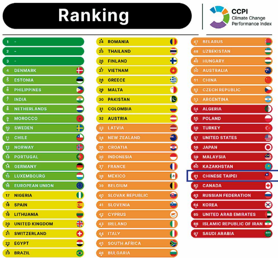
Figure 1. CCPI Ranking 2024 Report

COP28 marked the first time to review carbon emission performance of global countries. The result was published in "The Climate Change Performance Index 2024, CCPI Ranking 2024 Report ( https://newclimate.org/resources/publications/climate-change-performance-index-2024 )". As shown in Figure 1 , Taiwan ranks 61st after China at 51st, the U.S. at 57th, and Japan at 58th. Taiwan came in seventh from the bottom among all evaluated countries. The evaluation is based on four grades with different weights, namely, greenhouse gas emissions accounting for 40%, renewable energy for 20%, energy use for 20%, and climate policy for 20%. Taiwan's lower ranking shows that the government and the private sector have a lot of efforts to make.