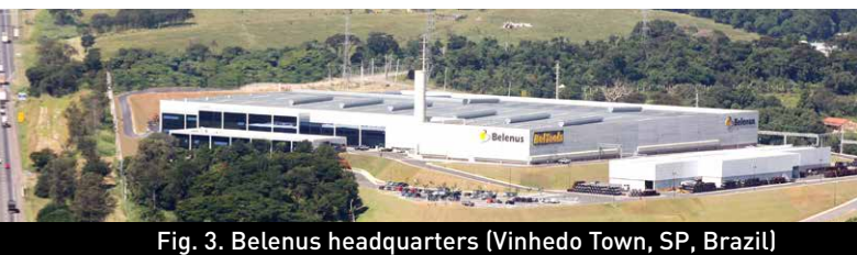
Fig. 3. Belenus headquarters (Vinhedo Town, SP, Brazil)

by Sergio Milatias, Editor Revista do Parafuso (The Fastener Brazil Magazine) milatias@revistadoparafuso.com.br www.revistadoparafuso.com