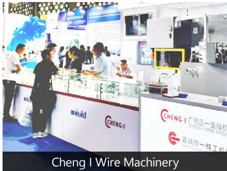
Cheng I Wire Machinery