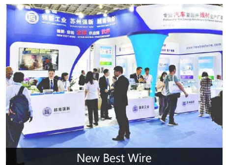
New Best Wire