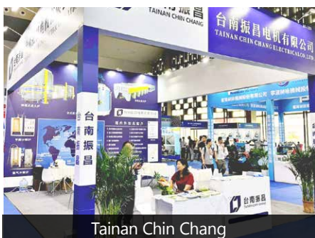
Tainan Chin Chang