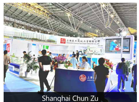
Shanghai Chun Zu