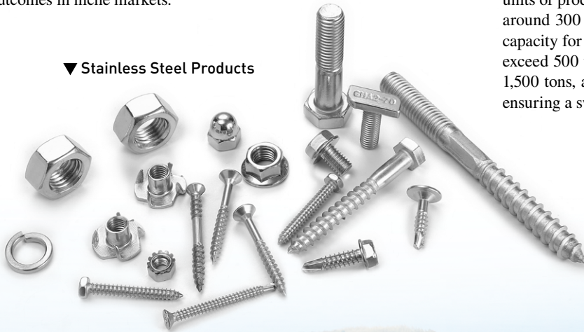
▼ Stainless Steel Products

In the midst of rapid global industrial development, Hisener is keeping pace with trends by embedding ESG (Environmental protection, Social responsibility, and Corporate governance) principles into every aspect of its operations. As a specialized fastener manufacturer and a big and experienced international trader, Hisener not only prioritizes sustainable development but also continually expands its product offerings to deliver higher value and cost-effective solutions for customers, aiming for mutually beneficial outcomes in niche markets.