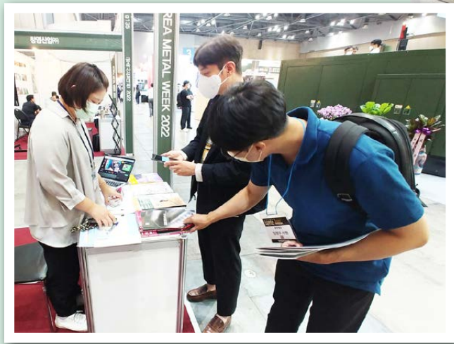
FASTENER WORLD INC. 匯達

Korea Metal Week has made it across 30 years since it debuted in 1989. Now it has become the top and benchmark metal and industrial parts related fair in South Korea, as well as a stepping stone to tap into the South Korean fastener and industrial parts market. The 2022 edition of this fair was held at Hall 3, Exhibition Center 1, KINTEX in Goyang City, S. Korea from September 21 to 23.