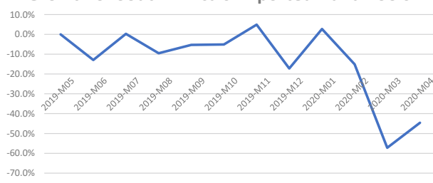
Unit: 1,000 USD