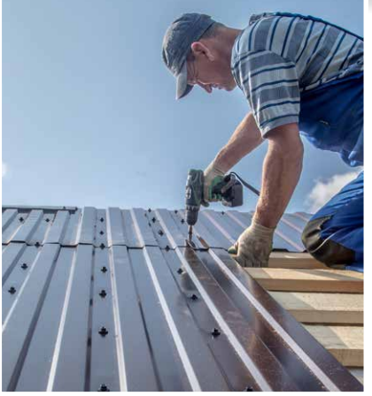
Figure 3: Installation of Exposed Fastener Metal Roof System

lthough metal has been a material option for roofs for hundreds of years, because of challenges posed by high cost, lousy appearance, and poor longevity, it has only recently become a feasible mainstream choice. In fact, today in the United States metal roofing represents one of the fastest growing areas in the residential roofing segment. It is now possible to choose from a selection of metal roofing solutions that either provide large, continuous panels or metal alternatives to traditional roofing materials such as slate, tiles, shakes, and shingles in attractive designs and at affordable prices. Although some of these solutions are more expensive in the shortterm than their traditional roofing options, their superior durability and life expectancy makes them a smarter long-term investment. Of course, like any roofing material they must be securely fixed to the roofing substructure to protect the interior spaces below. Since metal roofing solutions exhibit their own unique qualities and challenges, many of these solutions require special or different fasteners from nails and staples used with traditional roofing solutions. As metal roofing has grown then, so has the need for innovation and engineering in the fasteners for this market space.