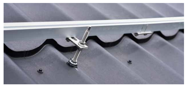
Figure 7: Example of Roof Mounting Solar Fastener System