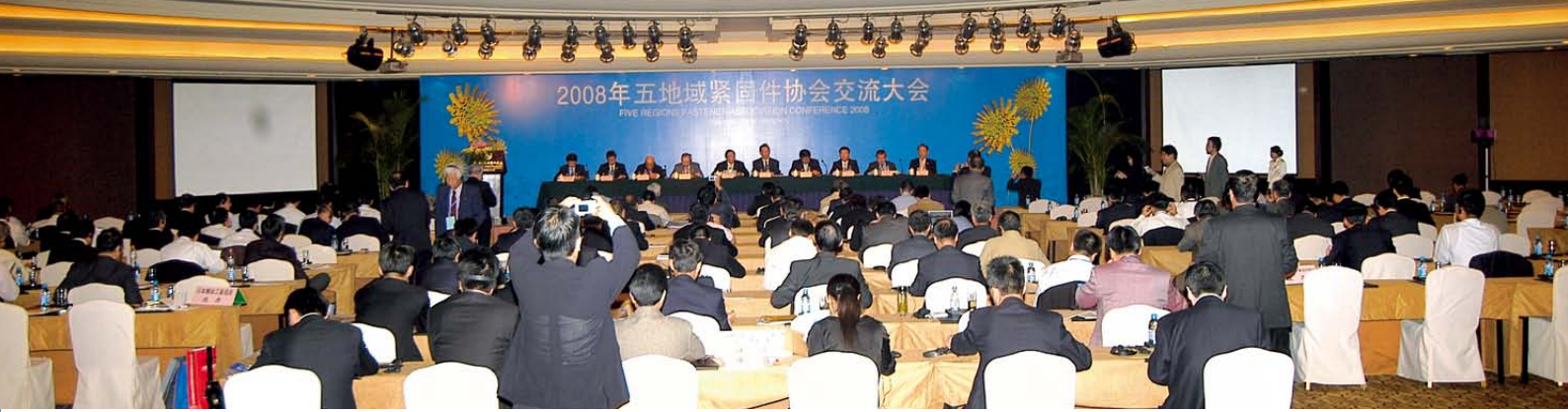
Five Region Fastener Association Conference took place in Hangzhou. Representatives from China, Japan, Taiwan, Hong Kong, and S. Korea shared the market situations. During the conference, the organizer also arranged participating guests to visit PTC Asia in Shanghai, Fastener Hardware Mall in Haiyan, and 3 leading Chinese fastener companies.