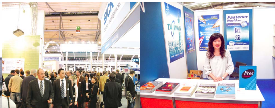
HANNOVER MESSE has always been a world's leading industrial technology event. The theme of 2008 focused on the most popular topics at that time: energy efficiency and climate protection. The booth of Fastener World was located in Hall 5, where small parts, metalworks and auto-parts were especially displayed.