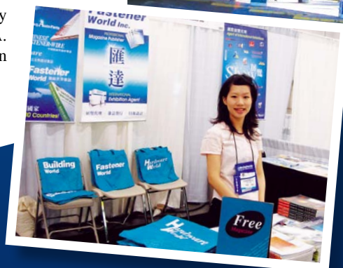
National Hardware Show and Lawn & Garden World was one of the biggest and well-known hardware tool shows. It reached its 61th anniversary. There were over 3,500 exhibitors in total, of which 102 were from Taiwan. This industry-leading event attracted many professional buyers to purchase various hardware, tools, houseware, and gardening products.