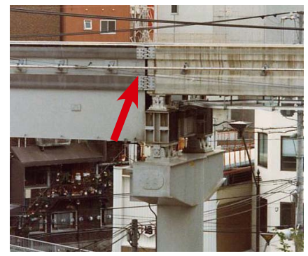
Fig. 8.11 Jointed part of monorail in Kitakyushu City (about 80 number of bolts/joint)