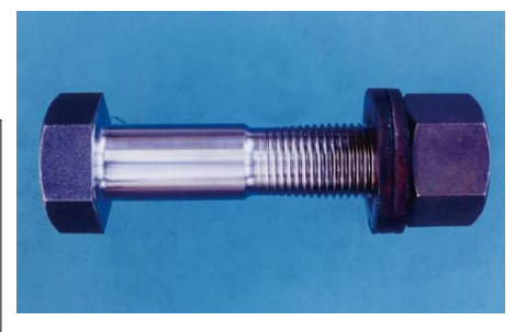
Fig. 8.19 The CD bolt for a climbing crane (M52 \times 235 \sim 250 \text{ mm in length})