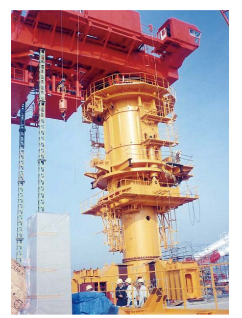
Fig. 8.17 Outer appearance of climbing crane