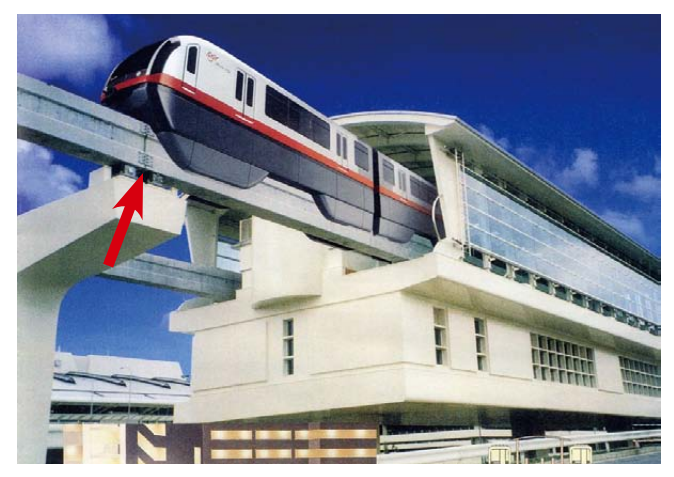
Fig. 8.13 Jointed part of monorail in Naha City

stretch along its longitudinal direction and is commonly adopted in the various types of iron bridges.