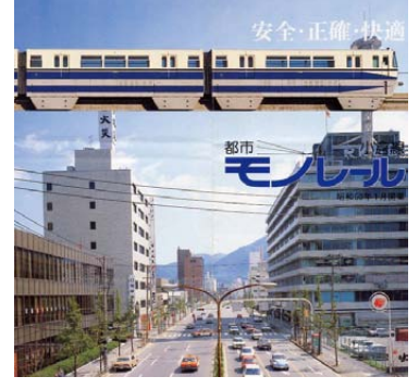
Fig. 8.10 Outer appearance of monorail in Kitakyushu City

Figure 8.10 shows an appearance of the running train in Kitakyushu mono-rail. As understood from the above figure, the mono-rail train runs across or along the road with busy traffic density from a height of about 10m above the ground. The rail of concrete is elastically jointed with fixed finger plate using about 80 bolts each 10m distance. This fixed finger plate is settled at the connected portion between the rails of concrete at the center portion in Fig. 8.11. This system allows only the