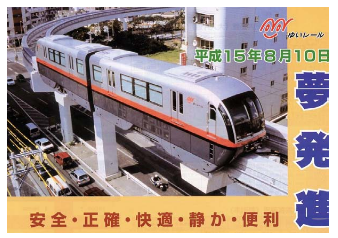
Fig. 8.12 Outer appearance of monorail in Naha City