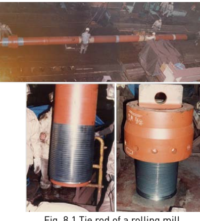
Fig. 8.1 Tie rod of a rolling mill ( \phi 475×13,975mm in length)