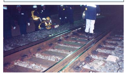
Fig. 8.6 Elastic joint of rail road in JR Tokai

Bolt: φ2.4cm×4.5cm in length (about 600gf) (September 14th in 1993, Asahi morning news-paper)