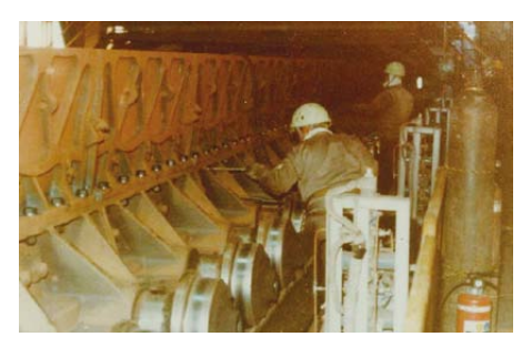
Fig. 8.15 Fastening work of the CD bolt to the side wall of a sintering machine