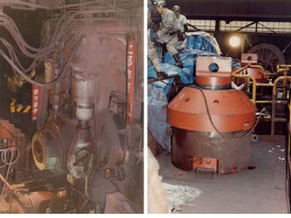
Fig. 8.2 Lower (left) and upper part (right) of a rolling mill