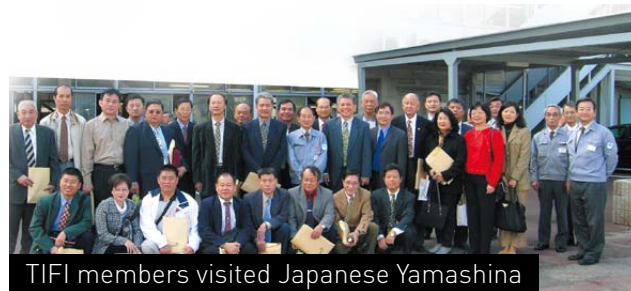
TIFI members visited Japanese Yamashina