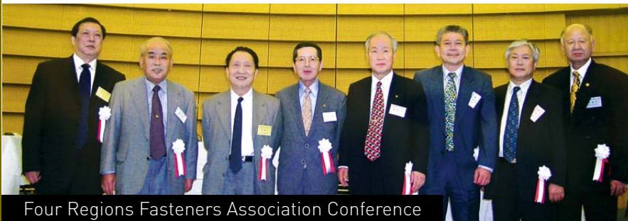
Four Regions Fasteners Association Conference