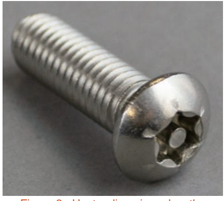
Figure 3 Upstanding pin makes the use of standard tools impossible.

and can be found on most 'branded' golf equipment like the threaded fasteners on drivers and woods. These require special torque wrenches to achieve change or adjustment. The use of two pin wrenches are also used to fasten cleats to spiked golf shoes.