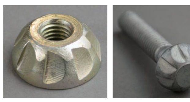
Figure 2 Right hand (clockwise) head design

The design of anti-vandal fastening devices is primarily based on the design of the driver used to apply the action. The fastener is often a threaded screw although it could be a spring clip. Figure Two shows how the torque required to tighten a thread is unidirectional meaning that using these head designs, it would be impossible to generate any force when trying to remove it.